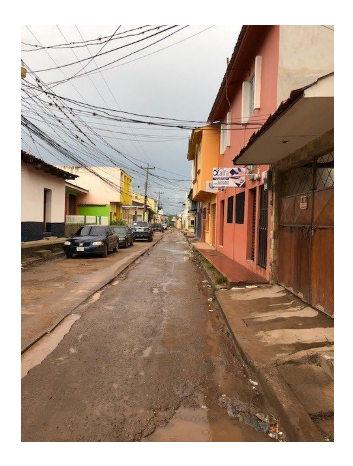
This is the street we live on and walk to our bus. Yes, it is safe here.